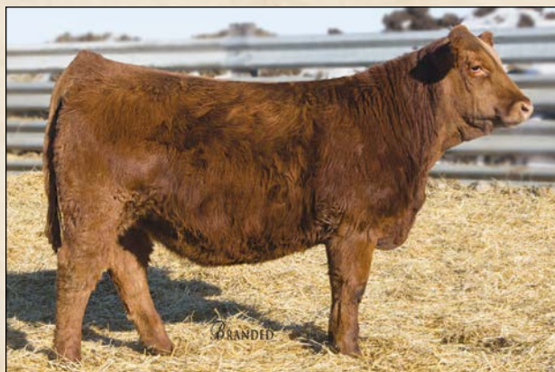
CMR Sunshine 94D • Sells as Donation Heifer.