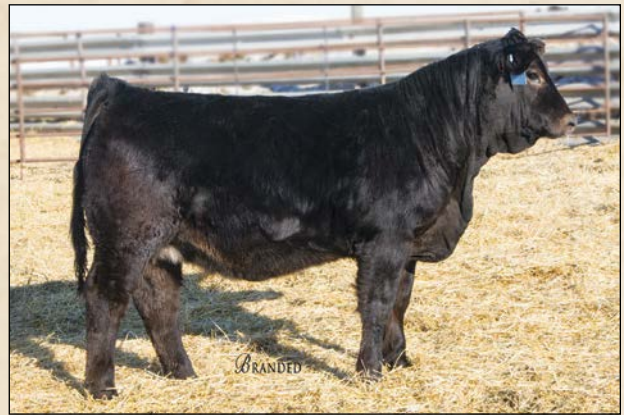
SGAR Dandy Gal 610 D • Sells as Lot 54.

Dandy's Gal is a thick well-proportioned heifer that is going to produce consistently in any replacement female program. This heifer is the maternal sister to our high selling heifer sold here at the Golden Rule last year. She displays as much or more potential than her half-sister. She will be the one to take a close look at. Sells open.