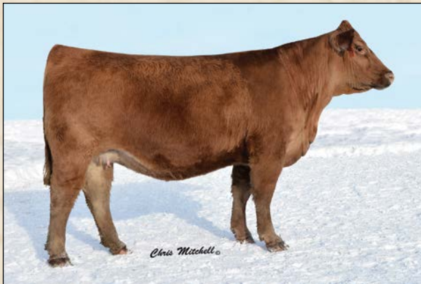
LRSF LRL Snazzy C73 • Sells as Lot 31.

This Sucker Punch daughter sure has the look! Fancy fronted, deep ribbed, and dark red in color - she'll sure catch your eye. We calved out the first group of Sucker Punch daughters last year and they made some awesome mothers, with every one having nearly perfect udder structure and teat size. She sells bred to COLB Mr Xavier, who has left an awesome set of calves over the years, including the 2013 futurity champion. Homo polled tests are pending and will be available by sale day. Sells bred to our calving specialist COLB Mr Xavier X812 for a 3/7/2017 purebred heifer calf.