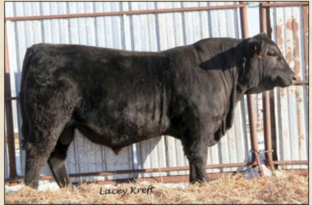
ZIMM Doc • Sells as Lot 1.

If you want to add pounds to your calves and keep replacement heifers that turn into brood cows take a look at this guy on sale day. Out of another Wohl Otto X7 Dam which proves that his daughters just flat out perform.