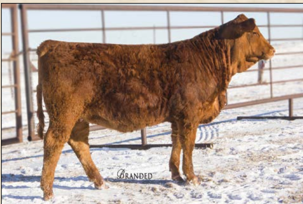
DCHD Golden Buckle Gelv 319D • Sells as Lot 51.