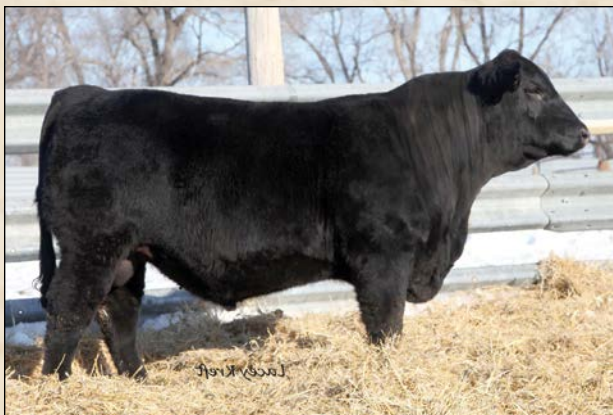
ZIMM Drake • Sells as Lot 7.

Calving ease with power, his Sire Connealy Counselor is known for exceptional maternal traits. Out of a first calf Wohl OTTO X7 DAM that did an exceptional job. He would not be for sale if we didn't have an abundance of this bloodline in our herd. Weaned at 823 with a weaning ratio of 105.