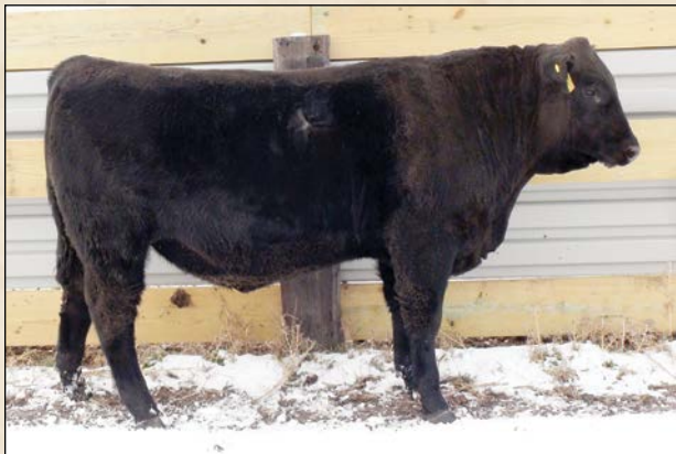
FGC D6 • Sells as Lot 22.