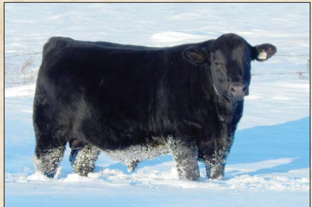
WOHL Brule's Gent D13 • Sells as Lot 19.

WOHL FARMS, JOHN WOHL Heifer bull and sire verified. He is smooth shouldered, consistent calving ease on sire and dam sides. Low birth weight with quick growth. Same cow family as 2016 high selling bull. Retaining 1/3 semen interest.