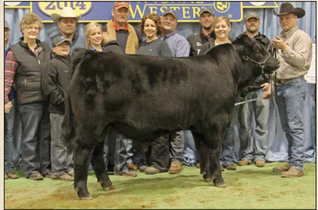
DLW Alumni 7513A • Sire of Lot 34.