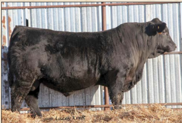
ZIMM Donnie • Sells as Lot 8.

Long bodied, deep, and thick son out of RB Tour Of Duty 177 an industry leader for growth and maternal. Combined with his Wohl Otto X7 DAM, wow can't wait to see his calves! Weaning weight of 816.