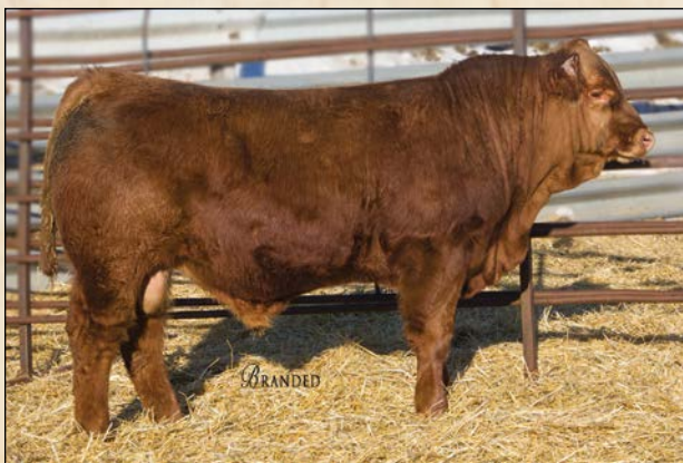
CMK D11 • Sells as Lot 9.

A son of Durango 366A we chose for our AI program. His sons have excelled in performance and eye appeal. D11 weaned with a ratio of 104. Outstanding cow family in our program that continues to produce some of our top calves every year. Dam of D11 is a full sister to the dam of lots 10 and 11.