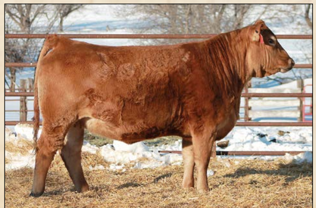
PHG Cowgirl C32 • Sells as Lot 29.

PRAIRIE HILLS GELBVIEH Cowgirl C32 is the first bred daughter of Jackson to sell at auction, and wow is she cool! This is a pedigree that will work in any herd, loaded with some major Canadian power houses on both the top and bottom sides. Deep ribbed and soft made, she's going to make an awesome mama cow. She sells bred to RWG Yikes, who's making quite the mark on our herd. We've used Yikes successfully on heifers the last two years and have been very impressed with the results. Homo polled results are pending and will be available by sale day. Sells bred to RWG Yikes 1512 for a 3/15/2017 purebred heifer calf.