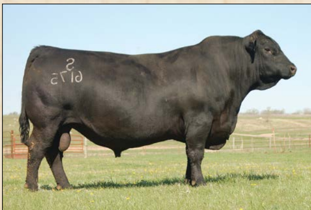
S Chisum 6175 • Sire of Lot 33.

Genomic enhanced EPDs. C1542 has been a standout from birth. She is deep and broody out of a dam that is super consistent. Her sire, Sandman 184Y has produced us a great set of females we are building our herd around. She is bred to our junior herd sire from YJ Mountain Ranch. PE 5-01-16 to 7-27-16 to JMR Up Start B54 (1316500)