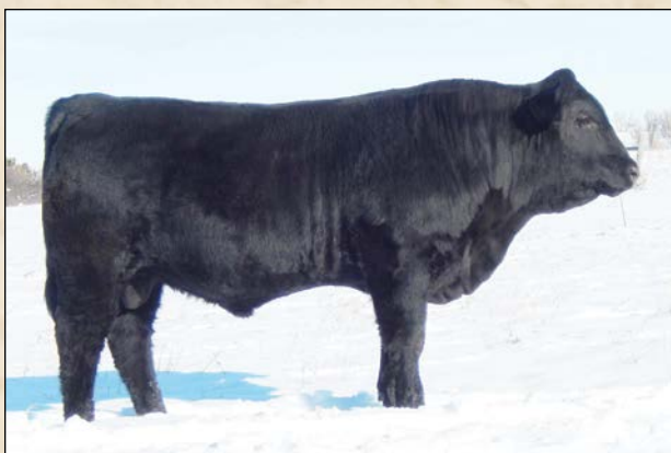
WOHL Ludlow Pepper D203 • Sells as Lot 15.

WOHL FARMS, JONATHAN WOHL Genomic enhanced EPDs. Length, thickness and sire verified. The N22 matriarch has a number of daughters producing bulls and replacement females. His sire reduced birthweight, kept thickness and length. Use him on cows for added weaning weight.