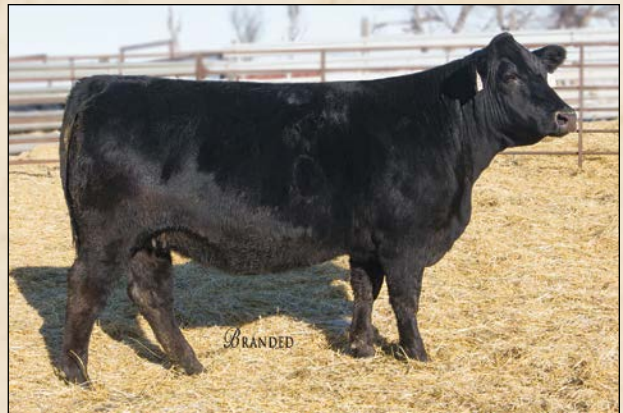
DDGR Adele 74C • Sells as Lot 36.

This heifer by the Connealy In Focus 4925 sire is a half-sister and almost a carbon copy of the Sydney 27B heifer sold in last year's sale where she was the high selling Balancer female. Adele's dam is a young cow that is doing a great job, with a nursing ratio of 105 on her first three calves. Due with a CCRO Leverage heifer calf on March 7.