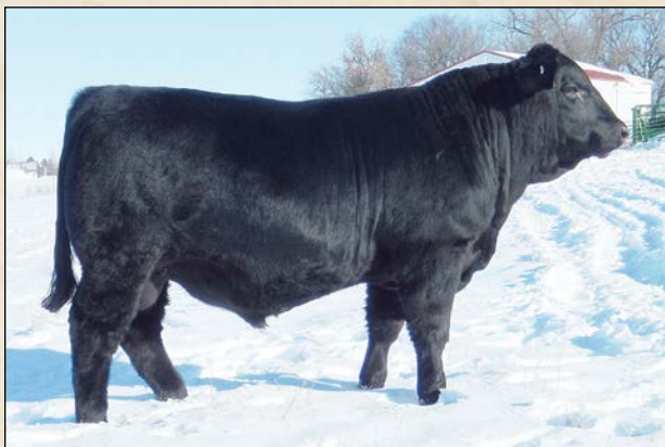
WOHL Leverage's Impact D55 • Sells as Lot 14.

WOHL FARMS, JOHN WOHL Genomic enhanced EPDs. Clean fronted, deep bodied and docile purebred. Dam is moderate framed with excellent udder and out of a solid producing cow family. He has all the components of a future herd sire. Sire verified and AI permit ready. Retaining 1/3 semen interest