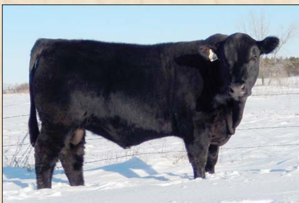
WOHL Ludlow North D31 • Sells as Lot 17.

WOHL FARMS, JOHN WOHL Genomic enhanced EPDs. Heifer bull and sire verified. Consistent low birth weight and calving ease on sire and dam sides. His stylish sire was selected to use for calving ease on heifers and add carcass value. He also added muscle and length to calves.