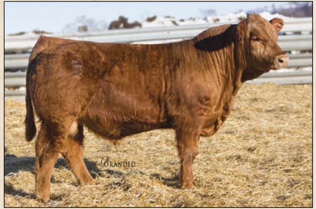
CMK D13 • Sells as Lot 10.

A son of Durango 366A we chose for our AI program. His sons have excelled in performance and eye appeal. Weaning ratio of 101. Outstanding cow family in our program that continues to produce some of our top calves every year. Dam of D13 is a full sister to the dam of lots 9 and 11.