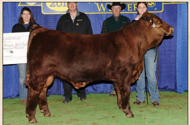
PHG Rockin the Bakken Z17 • Sire of Lots 3, 4.

Performance bull sired by a past Breeder's Choice Gelbvieh Bull Futurity Champion, PHG Rockin The Bakken. His dam is a true calving ease female that post a -4.5 birth weight EPD. 1D weaned with a weaning ratio of 109.