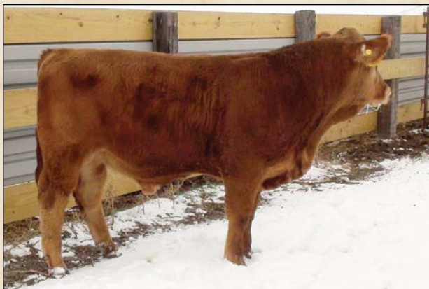
FGC D65 • Sells as Lot 24.

DAVID BEDKER A 75% Balancer Bull with strong carcass genetics and performance stacked on both sides of his pedigree. D8 is an excellent young bull with muscle expression and depth of body.