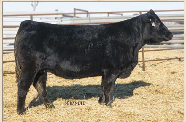
DDGR 9C • Sells as Lot 28.

DIAMOND D GELBVIEH This female has a great future with a very strong EPD profile and excellent carcass ultrasound data to go with it (112 ratio on ribeye and 113 ratio on IMF). Also, as a 75% Balancer you can breed her up for purebreds or down for Balancer calves. Her sire, the Post Rock Ten Plus bull, has left some real strong females in our herd. She is due on March 7 with an AI bull calf by the DLW Alumni sire.