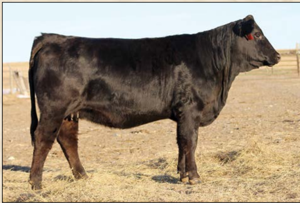
BRTV Chickadee • Sells as Lot 39.

The HXC Conquest Red Angus sire has worked great in our herd, producing moderate framed, thick made, low birthweight sons and daughters. You will have many breeding options with this heifer, as she has a very well balanced EPD profile. She is due on March 7 with a bull calf by our new red calving ease sire IVERS Jake C10 ET.