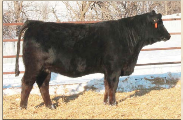
PHG Connie C20 • Sells as Lot 27.

PRAIRIE HILLS GELBVIEH Connie C20 is one of the very few Super Flex daughters to leave PHG. We lost Super Flex after his first breeding season, so these daughters are pretty rare! We've only sold two other daughters, and both have been sale toppers. C20 comes to us from a Payday daughter, who's dam was purchased out of this same sale. Homo black and polled tests are pending and will be available by sale day. Sells bred to our calving specialist COLB Mr Xavier X812 for a 4/10/2017 calf. Ultrasound was unable to determine the sex.