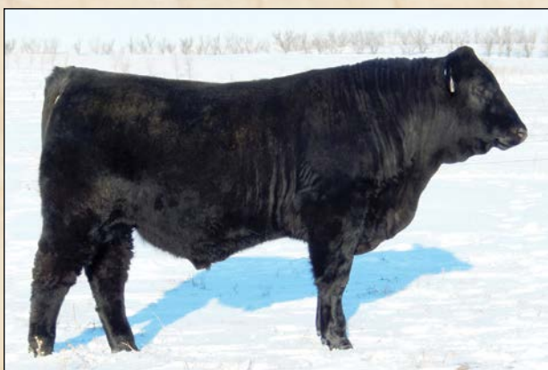
WOHL Brule's Focus D627 • Sells as Lot 25.

FEIST GELBVIEH Genomic enhanced EPDs. Dam is a Dam of Distinction that has weaned 11 calves for a weaning ratio of 104. Sired by DAHL 35A, a bull we purchased that is siring some outstanding calves. Posted a weaning ratio of 106.