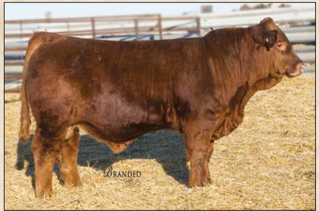
CMK D15 • Sells as Lot 11.

These 3 sons of Durango 366A are all out of full sisters making them all full brothers in blood. D15 weaned with a ratio of 109. This cow family is very strong for performance and maternal values in our program. Dam of D15 is a full sister to the dam of lots 9 and 10.