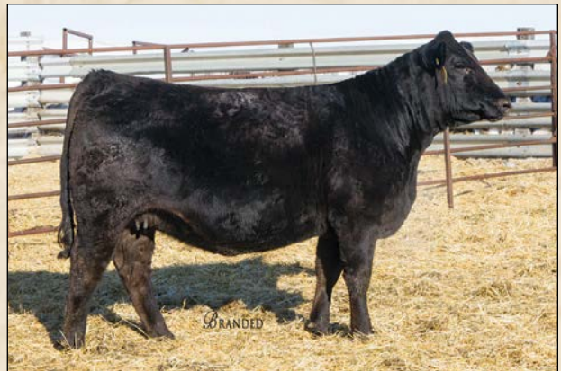
DDGR 72C • Sells as Lot 35.

Exceptional volume and depth of rib on this purebred daughter of the Alumni sire. Her dam is also an attractive female with ample capacity and is a daughter of the Patriots Minuteman sire that was known for his high quality daughters. She is due on March 20 with a purebred bull calf by our new black calving ease sire, CKS Dream C11.