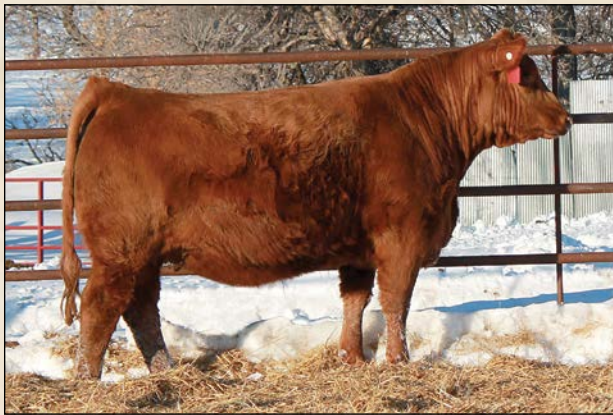
PHG Miss Paparazzi C45 • Sells as Lot 30.