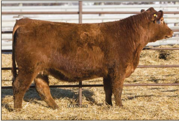
DDGR 93C • Sells as Lot 38.