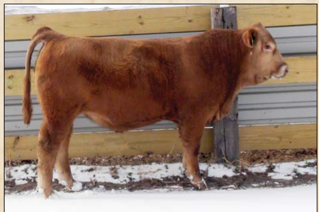
FGC D5 • Sells as Lot 21.

FEIST GELBVIEW Genomic enhanced EPDs. Sired by DAHL 35A, a bull we purchased that is siring some outstanding calves. D5 weaned over 800 pounds with a weaning ratio of 115. This red bull can give you performance and extra weaning weight in your calves. His dam is a Dam of Distinction.