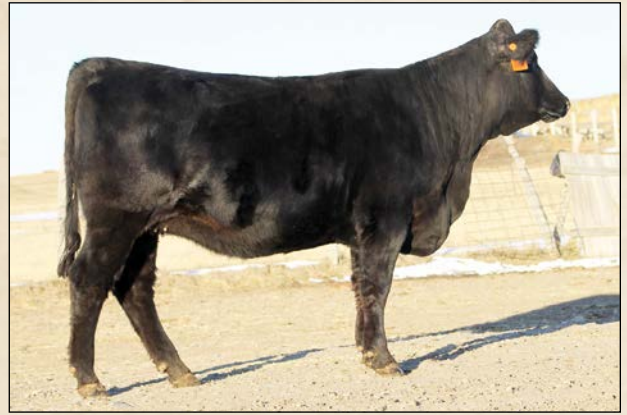
JMAU Cindy Lou • Sells as Lot 26.

RUSHMORE GELBVIEH Genomic enhanced EPDs. A moderate framed daughter of VRT Lazy TV Sam U451 and a CTR Good Night 715T dam that continues to produce one of our top calves every year. Strong maternal strength with a nice combination of muscle and femininity. Al'd 5-10-16 to Buck's Carolina Rockn (794476). PE 5-14-16 to 7-27-16 to YJMR Up Start B54 (1316500)