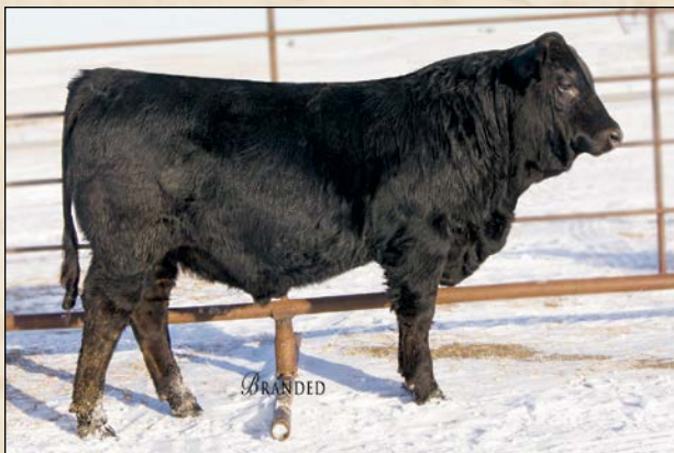
BDKR D8 • Sells as Lot 23.

FEIST GELBVIEH Genomic enhanced EPDs. Performance bull that weaned at 800 pounds with a weaning ratio of 112. Note the weaning and yearling EPDs that rank in the top 1 and 2 percent respectively.