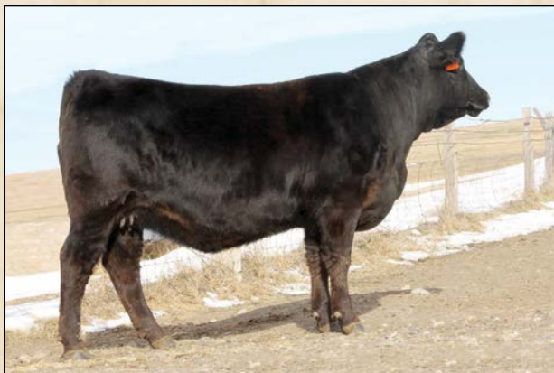
CJLL Cammie • Sells as Lot 32.

Genomic enhanced EPDs. LRL Snazzy C73 is a very balanced, deep ribbed purebred female with a great disposition. She stems from one of our best Gelbvieh cow families and looks to be setting down an excellent udder. She also has very balanced EPD package with 9 traits ranking at or above breed average. She sells safe to H2R Profitbuilder B403 (AMAR 1683223), carrying a heifer calf that should have a tremendous set of EPD's considering Profitbuilder has 10 traits ranking in the top 25% of the breed.