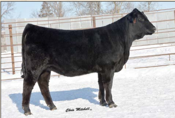
LRSF LRL Nellie D40 • Sells as Lot 50.

SARAH & VERRICK SCHOCK Daisy Duke is a stylish female. She is put together with plenty of length and thickness without giving up her feminine qualities. Her mother is a high producing, excellent milking female wrapped in a moderate frame. When you combine all of these traits it makes her a valuable addition to any herd and a top show prospect. Sells open.