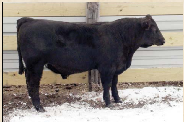
FGC D4 • Sells as Lot 20.

FEIST GELBVIEW Genomic enhanced EPDs. Black homozygous polled 50% Balancer bull packed full of performance. Weaning ratio of 104 with a weaning and yearling EPD that rank in the top 1% of the breed. His sire won the North Dakota Angus feed trial. D4 will sire calves with explosive growth and great feedlot performance.