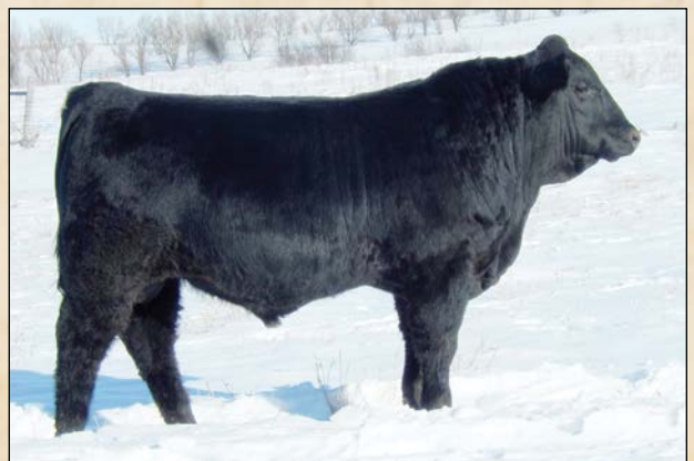
WOHL Leverage's Pepper D23 • Sells as Lot 13.

Genomic enhanced EPDs. Powerhouse bull from a moderate built female. He is packed with muscle and has a cow family that demonstrates producing replacement females and high weaning weights. Three bulls in this year's sale going back to dam N22. Sire verified and docile. Retaining 1/3 semen interest.