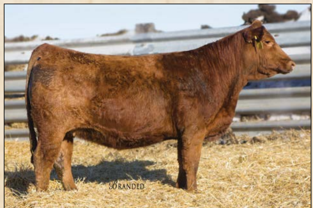
DDGR 87C • Sells as Lot 37.

An attractive purebred daughter of the DDGR All In 1A sire that was the high selling bull in our 2014 production sale. Her EPD's indicate a nice spread from birth to weaning and yearling as well as a marbling EPD in the top 15% of the breed. She is due with a purebred bull calf on March 7 by the popular AI sire BNC At Ease.