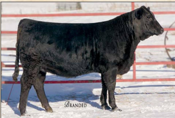
BDOC Deja 333D • Sells as Lot 52.