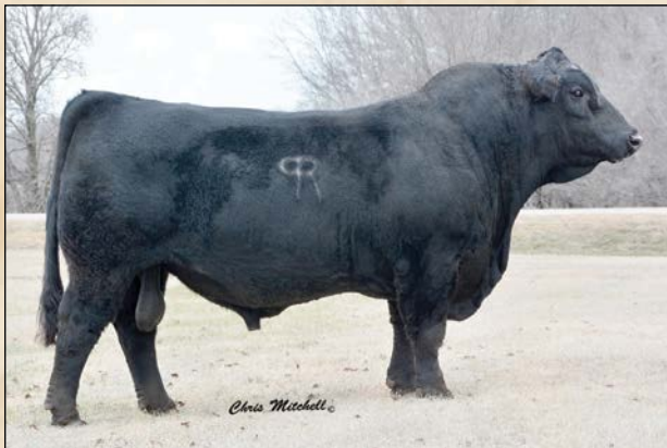
DCSF Post Rock Astronaut 157A • Sire of Lot 45.