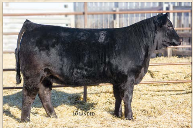
SGAR Miss Dally 602D • Sells as Lot 55.

Dally is the first calf we have raised out of the awesome PHG Z21 cow. She has a moderate birthweight and really grew displaying profitable growth potential. She has loads of body and at the same time she is clean fronted and stylish. This gives her the moderate size and overall appearance that producers are looking for. Sells open.