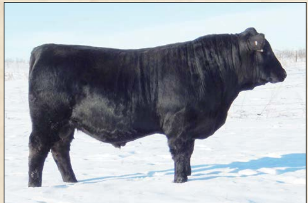
WOHL Impact Firewall D21 • Sells as Lot 18.

WOHL FARMS, JOHN WOHL Genomic enhanced EPDs. Heifer bull and sire verified. Another Y353 bull calf with consistent low birth weight and calving ease. Very moderate frame with muscle packed on. Cow family has placed high sellers in previous NDGA sales.