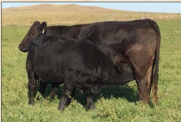
WOHL Brule's Impact D37 • Sells as Lot 16.