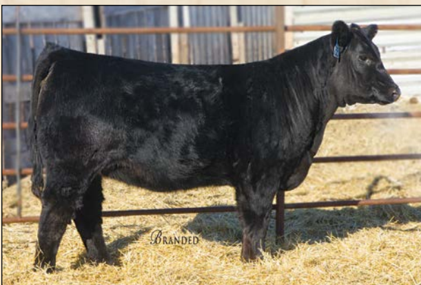
SGAR Daisy Duke 603D • Sells as Lot 53.