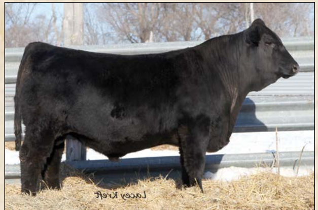
ZIMM Dakota • Sells as Lot 2.

A 75% that is as clean and smooth as you will find. Keep all of his daughters as he is out of a great cow family. Homo Black and Homo Polled